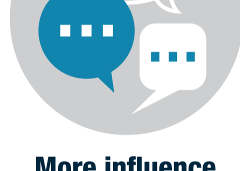
More influence of customers