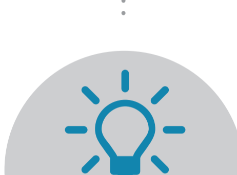
Agility, speed, scale, responsiveness