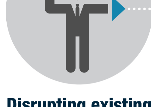
Disrupting existing business operations