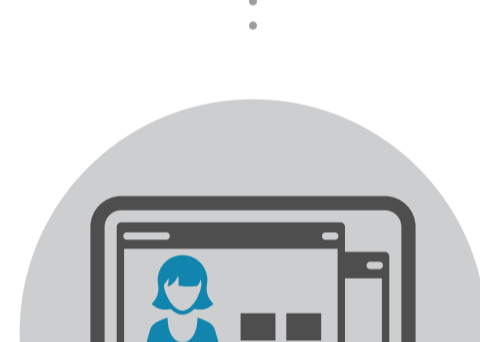
Combining people, business and physical world

Conventional business applications are not able to meet these demands and challenges!