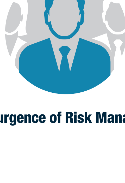
Resurgence of Risk Managers