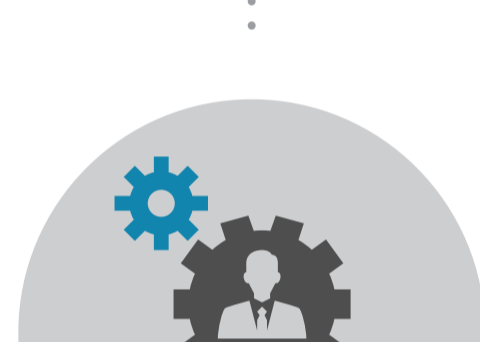
"Supermaneuverable" business processes