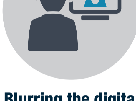
Blurring the digital and physical world